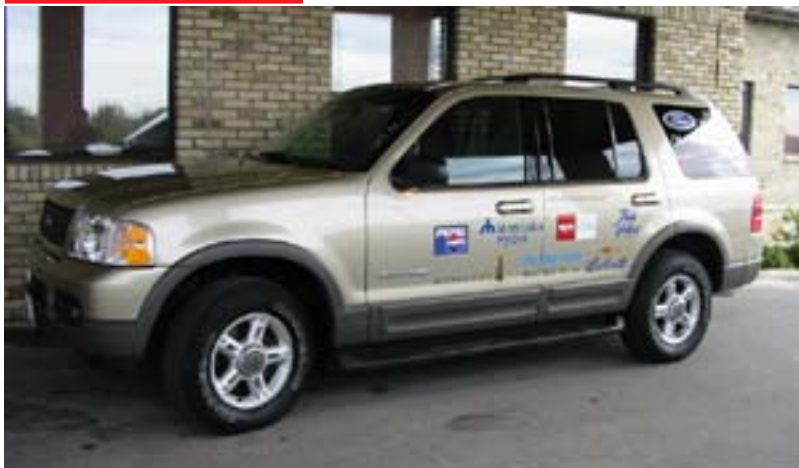
Keep your eyes open for the latest addition to the Championships Office. Pictured above is the Ford Explorer provided by Ford to promote the 2003 Ford World Curling Championships.