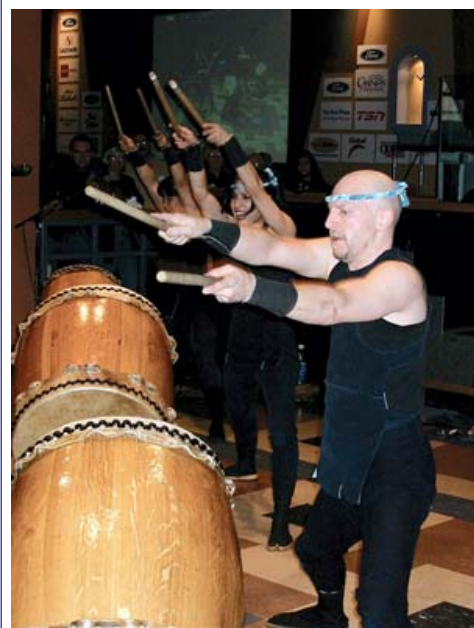
Fubuki Daiko Japanese Drummers entertaining at the first Rally.