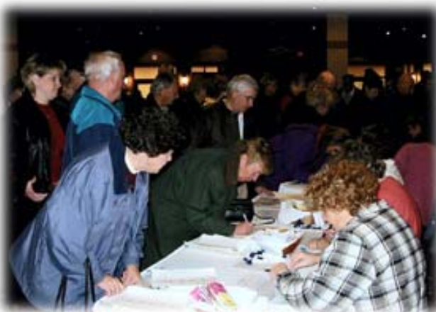
Volunteers registering at the first Rally.